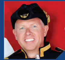
Vice Admiral KIT PURDY