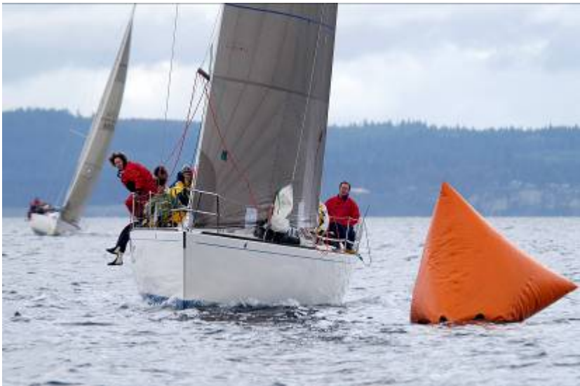
Declaration of Independence – SYC 2004 Sailboat of the Year