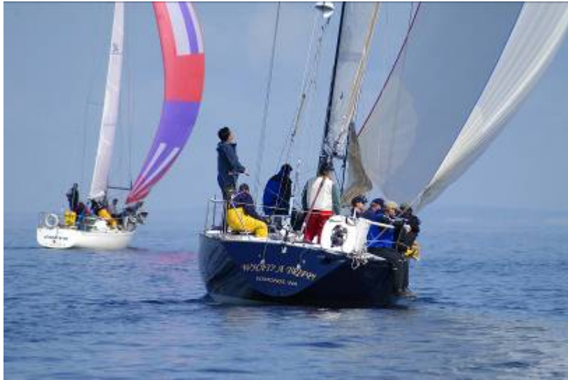
What a Tripp! Drifting towards Smith Island