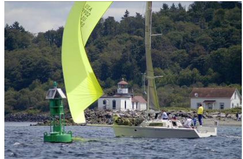
Terremoto runs past the lighthouse