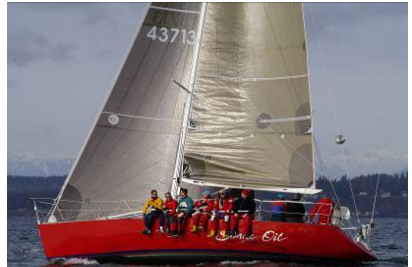
Snake Oil in the groove in the Blakely Rocks Race