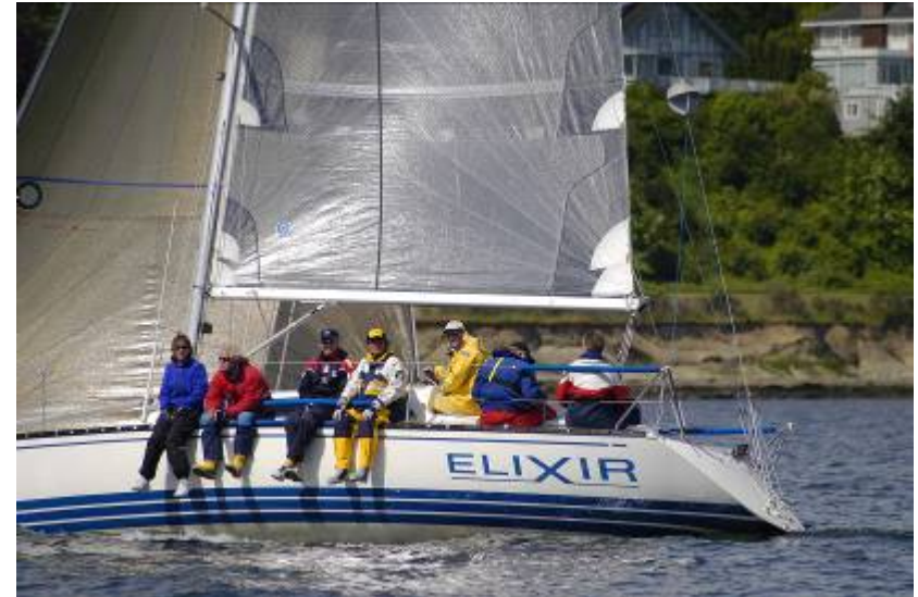
Elixir in the Blake Island Race