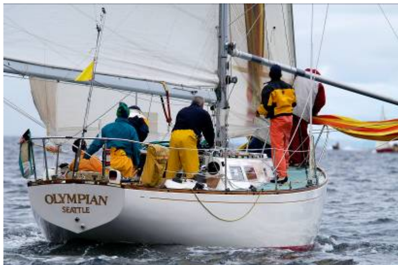
Olympian hoisting the kite in the Star and Bar