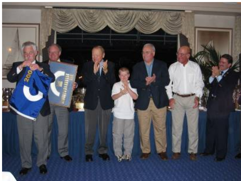
2004 Awards Banquet Photo by Diane Haelsig.