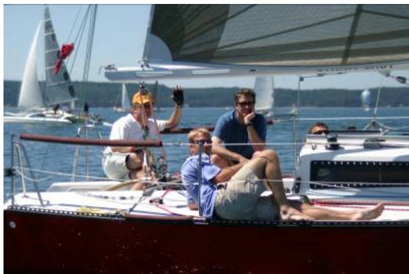
The crew on Straight Shot between races at Whidbey Island Race Week Photo by Borrowed Light Images.

The 2005 racing activities culminate with the 28th Annual Grand Prix Invitational Regatta. Boats must qualify for this prestigious invitation-only event. Qualification criteria can be found in the Notice of Race. You have several chances to qualify, so get out there and give it a shot. The Grand Prix puts a premium on all aspects of racing by featuring both buoy and distance racing over a three-day period with parties every evening. What a great way to wrap up the racing season!