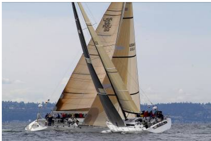
Coruba and Neptune's Car cross paths in the Blake Island Regatta