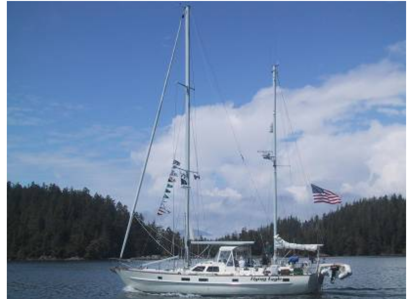
Flying Eagle along Barkley Sound in the 2004 NORPAC