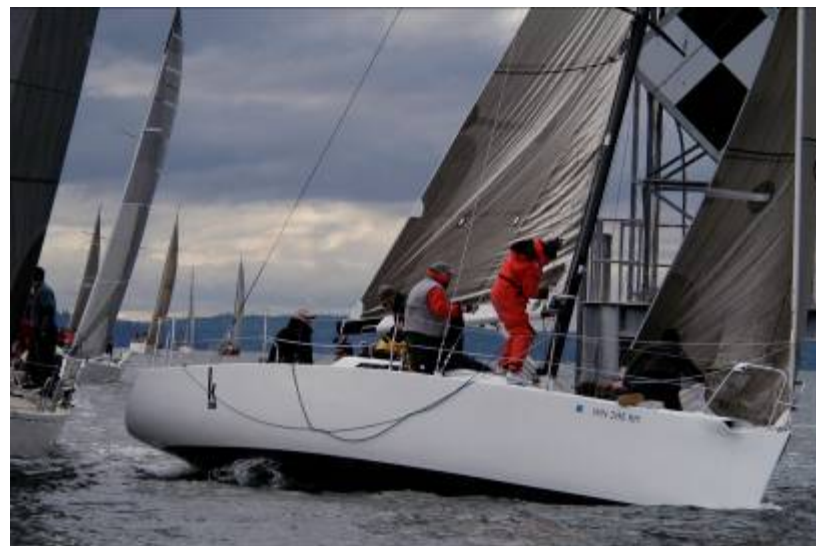
Kilo rounds the mark in the Duwamish Head Race Photo by Borrowed Light Images.