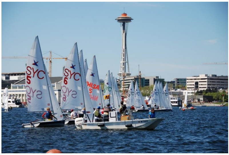
High School Sailing Championships on Lake Union.

Phone: 206.926.1011. Email: brianl@seattleyachtclub.org