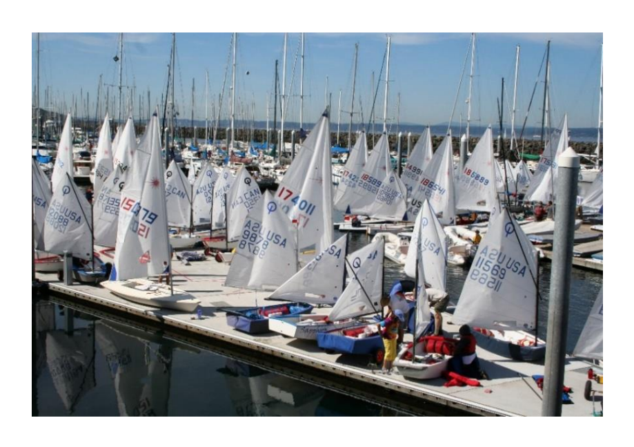
Seattle Yacht Club hosts PNW Junior Olympics Regatta.