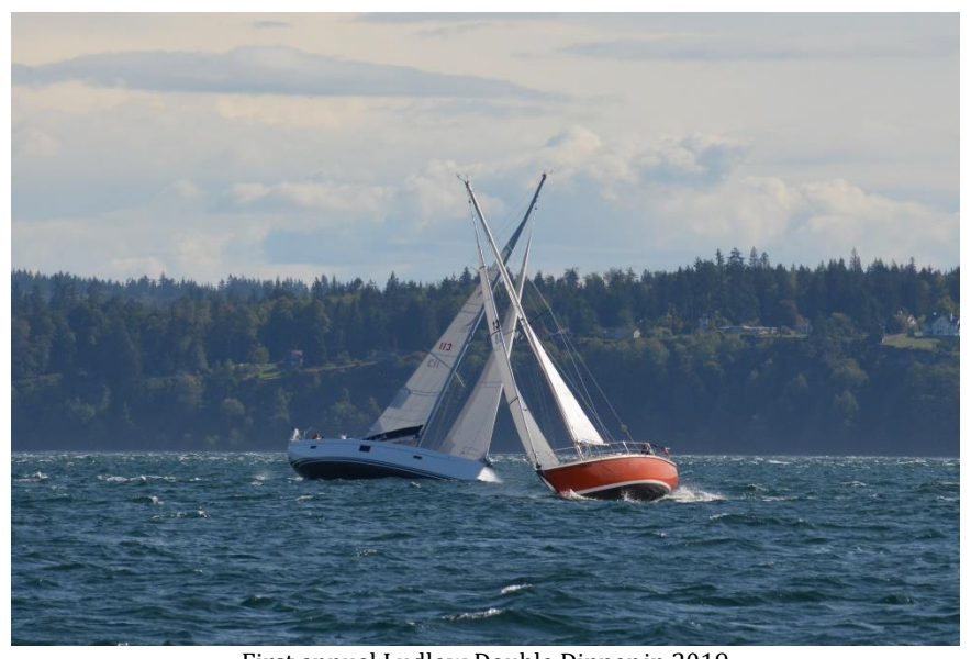
First annual Ludlow Double Dipper in 2019