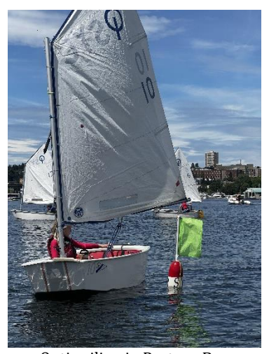
Opti sailing in Portage Bay

This year's program will run from June 15 to September 4. Classes run from 9:00 AM - 4:00 PM, Monday through Friday. Students can sign up for a week at a time, and for multiple weeks during the summer!!