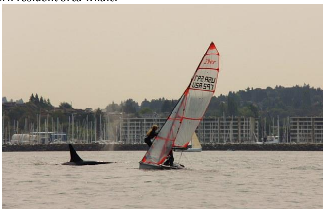
Sailors at Jr. Olympics avoid feeding the Orcas!