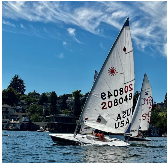
Laser and Vanguard 15 on Portage Bay