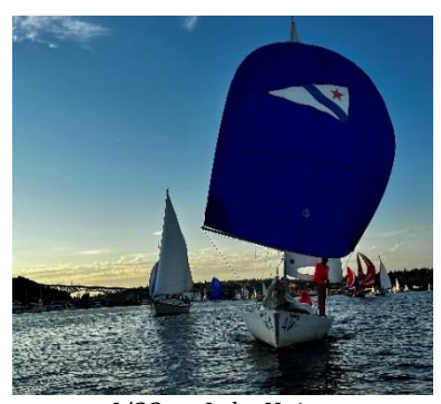
J/22 on Lake Union