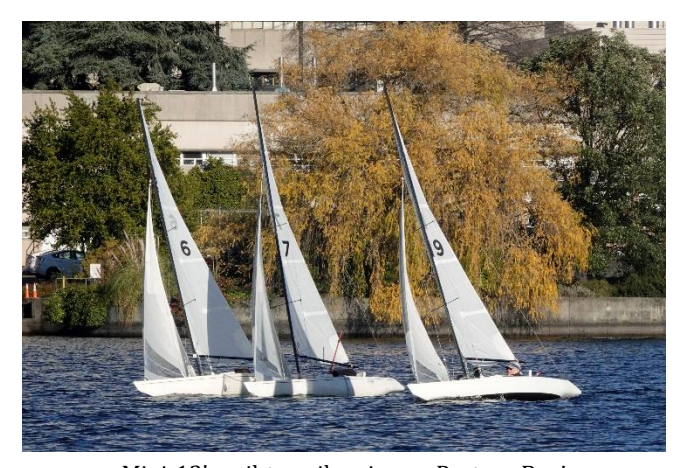
Mini-12's rail-to-rail racing on Portage Bay!

Every year we have seven series consisting of five regattas each. And with our friends at Royal Victoria Yacht Club and their ten boats, our two clubs alternate as host for an annual Inter-Club Team Race Regatta.