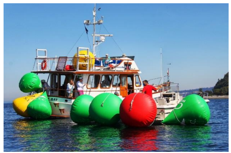
Race Committee Boat - Portage Bay